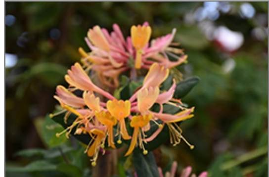
Goldflame Honeysuckle flowers