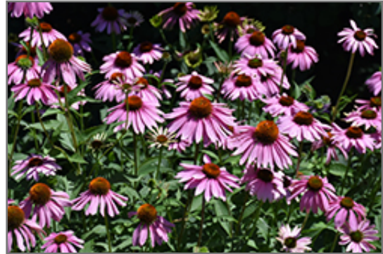
Magnus Coneflower flowers