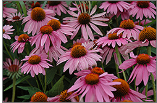
Magnus Coneflower flowers

Magnus Coneflower is an herbaceous perennial with an upright spreading habit of growth. Its medium texture blends into the garden, but can always be balanced by a couple of finer or coarser plants for an effective composition.