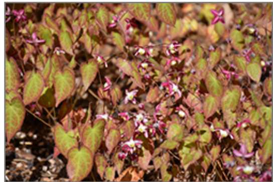
Bishop's Hat in bloom