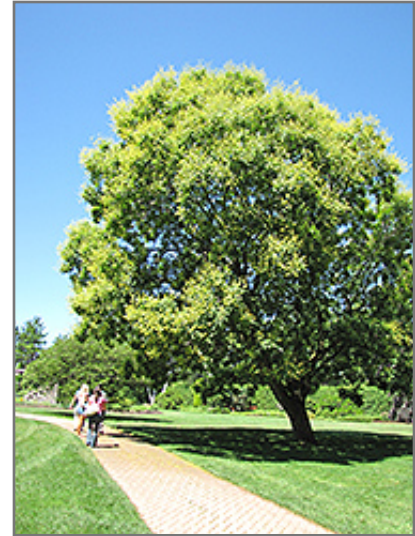
Golden Rain Tree in bloom