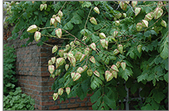
Golden Rain Tree fruit

This tree should only be grown in full sunlight. It is very adaptable to both dry and moist locations, and should do just fine under average home landscape conditions. It is considered to be drought-tolerant, and thus makes an ideal choice for xeriscaping or the moisture-conserving landscape. It is not particular as to soil type or pH, and is able to handle environmental salt. It is highly tolerant of urban pollution and will even thrive in inner city environments. This species is not originally from North America, and parts of it are known to be toxic to humans and animals, so care should be exercised in planting it around children and pets.