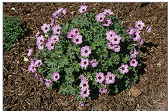
Ballerina Cranesbill flowers