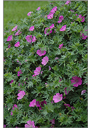
Bloody Cranesbill flowers

This is a relatively low maintenance plant, and should only be pruned after flowering to avoid removing any of the current season's flowers. It is a good choice for attracting butterflies to your yard, but is not particularly attractive to deer who tend to leave it alone in favor of tastier treats. Gardeners should be aware of the following characteristic(s) that may warrant special consideration;