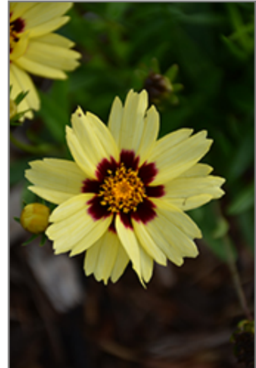
UpTick Cream and Red Tickseed flowers

UpTick Cream and Red Tickseed is recommended for the following landscape applications;