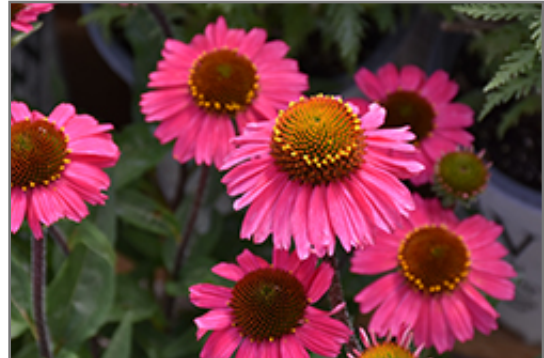
Sensation Pink Coneflower flowers

This is a relatively low maintenance plant, and is best cleaned up in early spring before it resumes active growth for the season. It is a good choice for attracting bees and butterflies to your yard, but is not particularly attractive to deer who tend to leave it alone in favor of tastier treats. It has no significant negative characteristics.