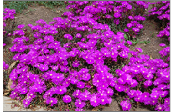
Jewel Of Desert Opal Ice Plant in bloom