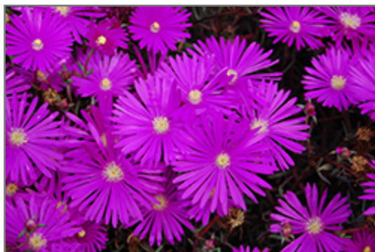
Jewel Of Desert Opal Ice Plant flowers