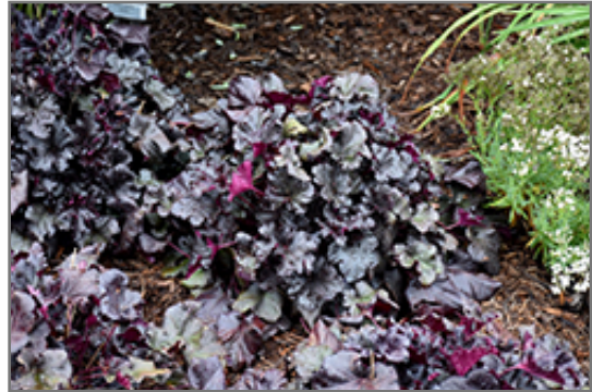
Black Pearl Coral Bells

Black Pearl Coral Bells is a fine choice for the garden, but it is also a good selection for planting in outdoor pots and containers. With its upright habit of growth, it is best suited for use as a 'thriller' in the 'spiller-thriller-filler' container combination; plant it near the center of the pot, surrounded by smaller plants and those that spill over the edges. Note that when growing plants in outdoor containers and baskets, they may require more frequent waterings than they would in the yard or garden.