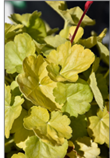
Dolce Appletini Coral Bells foliage

Dolce Appletini Coral Bells is a fine choice for the garden, but it is also a good selection for planting in outdoor pots and containers. With its upright habit of growth, it is best suited for use as a 'thriller' in the 'spiller-thriller-filler' container combination; plant it near the center of the pot, surrounded by smaller plants and those that spill over the edges. Note that when growing plants in outdoor containers and baskets, they may require more frequent waterings than they would in the yard or garden.