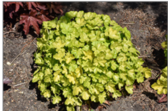
Dolce Appletini Coral Bells