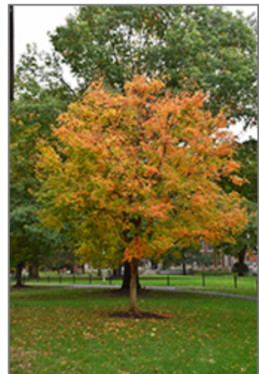
Three Flowered Maple in fall