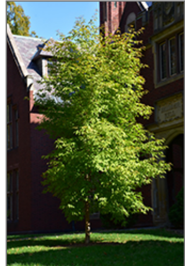
Three Flowered Maple