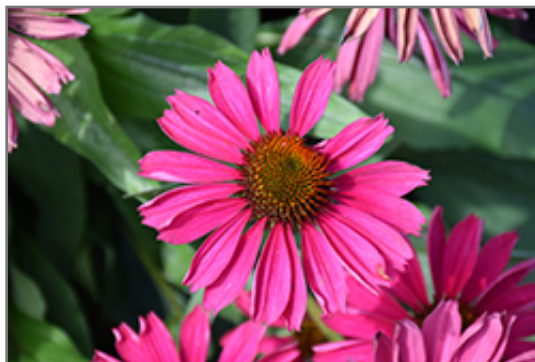
Kismet Raspberry Coneflower flowers