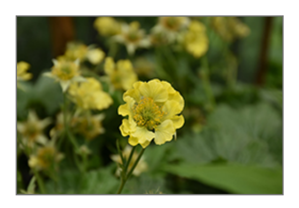
Cocktails Banana Daiquiri Avens flowers