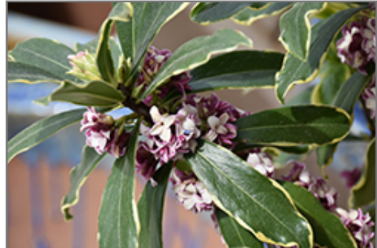
Moonlight Parfait Winter Daphne flowers

This shrub will require occasional maintenance and upkeep, and should never be pruned except to remove any dieback, as it tends not to take pruning well. Deer don't particularly care for this plant and will usually leave it alone in favor of tastier treats. Gardeners should be aware of the following characteristic(s) that may warrant special consideration;