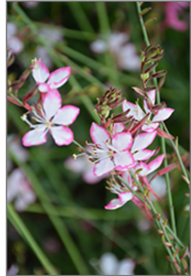
Rosy Jane Gaura flowers

Rosy Jane Gaura is recommended for the following landscape applications;