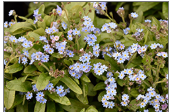
Victoria Blue Forget-Me-Not flowers