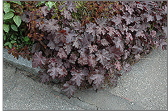
Stormy Seas Coral Bells

Stormy Seas Coral Bells is recommended for the following landscape applications;