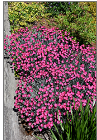
Wicked Witch Pinks in bloom