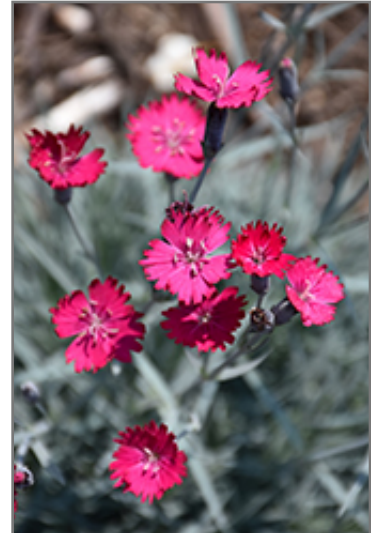
Wicked Witch Pinks flowers

Wicked Witch Pinks is recommended for the following landscape applications;