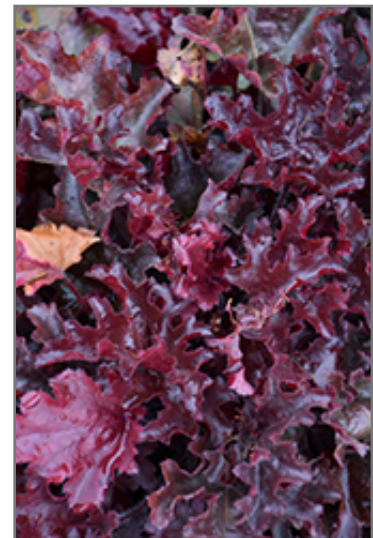
Dolce Cherry Truffles Coral Bells foliage