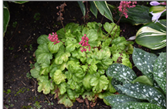
Timeless Glow Coral Bells

This is a relatively low maintenance plant, and should be cut back in late fall in preparation for winter. It is a good choice for attracting butterflies and hummingbirds to your yard. It has no significant negative characteristics.