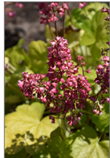
Timeless Glow Coral Bells flowers