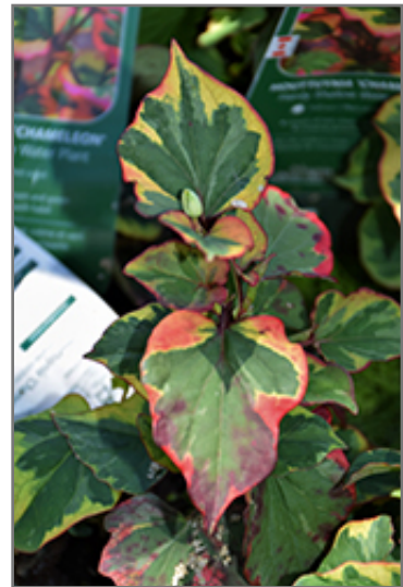
Variegated Chameleon Plant foliage