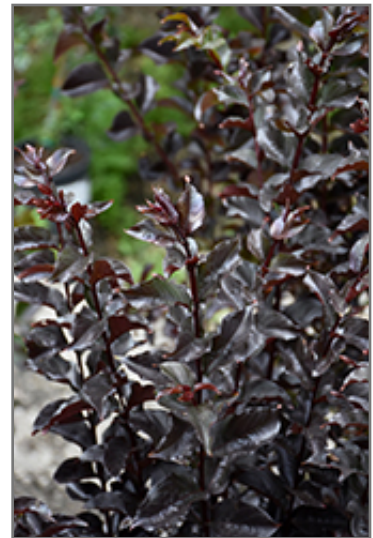
Ebony Flame Crapemyrtle foliage