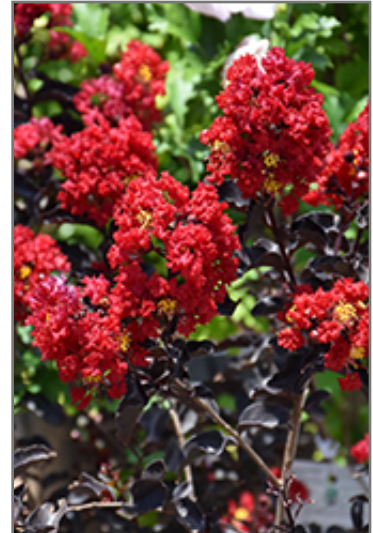
Ebony Flame Crapemyrtle flowers