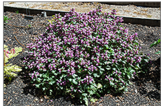
Beacon Silver Spotted Dead Nettle in bloom