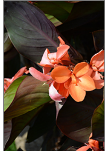
CannaSol Happy Wilma Canna flowers

This plant is native to the tropics and prefers growing in moist environments with evenly warm conditions all year round. In our climate, it is usually grown as an outdoor annual in the garden or in a container. If you want it to survive the winter, it can be brought in to the house and provided with special care, and then returned to the garden the following season. In its preferred tropical habitat, it can grow to be around 18 inches tall at maturity, with a spread of 14 inches. However, when grown as an annual or when overwintered indoors, it can be expected to perform differently, and its exact height and spread will depend on many factors; you may wish to consult with our experts as to how it might perform in your specific application and growing conditions.