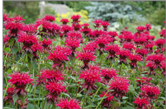
Raspberry Wine Beebalm flowers