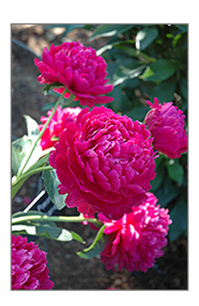
Paul Wild Peony flowers

Paul Wild Peony will grow to be about 30 inches tall at maturity, with a spread of 3 feet. When grown in masses or used as a bedding plant, individual plants should be spaced approximately 30 inches apart. The flower stalks can be weak and so it may require staking in exposed sites or excessively rich soils. It grows at a slow rate, and under ideal conditions can be expected to live for approximately 20 years. As an herbaceous perennial, this plant will usually die back to the crown each winter, and will regrow from the base each spring. Be careful not to disturb the crown in late winter when it may not be readily seen!