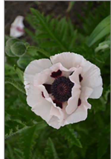
Royal Wedding Poppy flowers