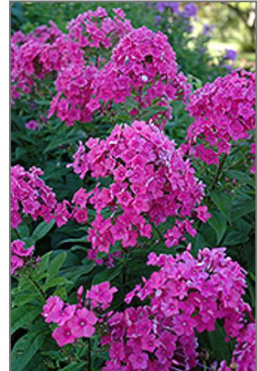
Eva Cullum Garden Phlox flowers