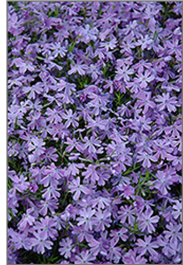
Emerald Blue Moss Phlox flowers

Emerald Blue Moss Phlox is recommended for the following landscape applications;