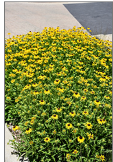
Viette's Little Suzy Coneflower in bloom