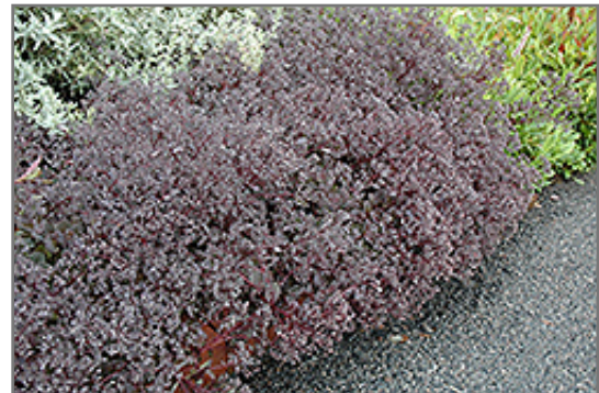
Bertram Anderson Stonecrop