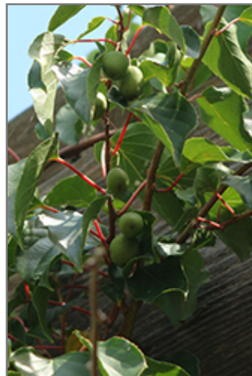
Ananasnaya Female Hardy Kiwi fruit

Aside from its primary use as an edible, Ananasnaya Female Hardy Kiwi is suitable for the following landscape applications;