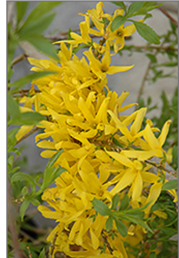
Gold Tide Forsythia flowers

Gold Tide Forsythia is recommended for the following landscape applications;