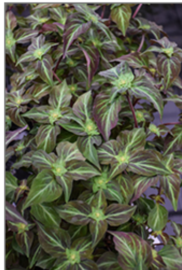
Night Light Moneywort foliage