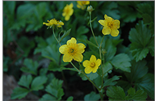
Barren Strawberry flowers