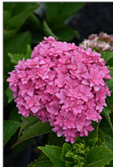
Starfield Hydrangea flowers