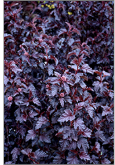
Panther Ninebark foliage

Panther Ninebark is recommended for the following landscape applications;