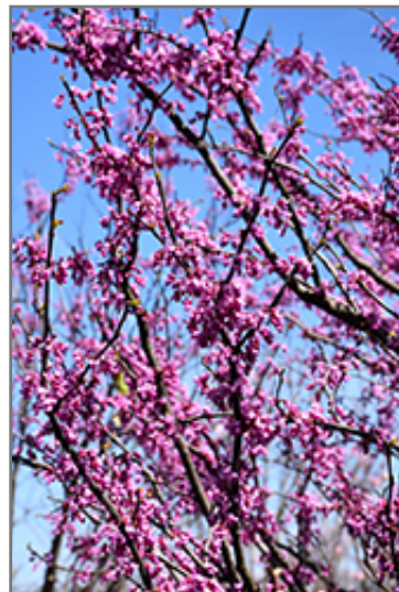
Sparkling Wine Redbud flowers