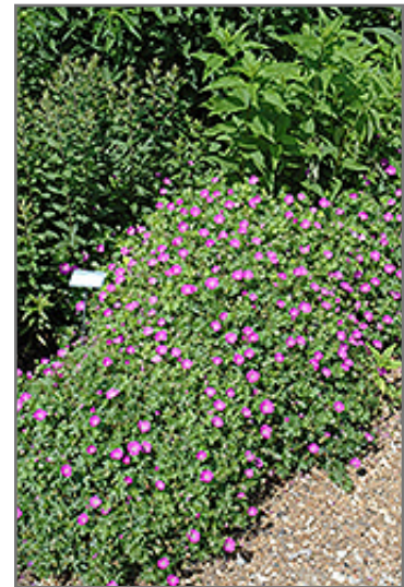
Max Frei Cranesbill in bloom