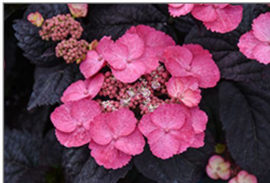
Pink Dynamo Hydrangea flowers

Pink Dynamo Hydrangea is recommended for the following landscape applications;