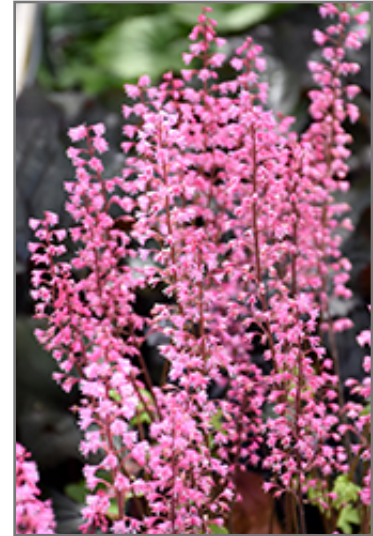
Dayglow Pink Foamy Bells flowers

Dayglow Pink Foamy Bells is a fine choice for the garden, but it is also a good selection for planting in outdoor pots and containers. It is often used as a 'filler' in the 'spiller-thriller-filler' container combination, providing a mass of flowers and foliage against which the larger thriller plants stand out. Note that when growing plants in outdoor containers and baskets, they may require more frequent waterings than they would in the yard or garden.