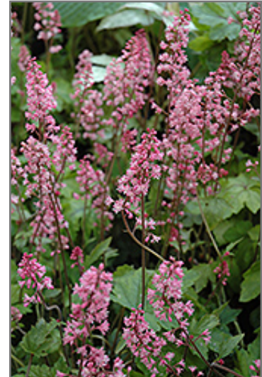
Dayglow Pink Foamy Bells flowers

This is a relatively low maintenance plant, and is best cleaned up in early spring before it resumes active growth for the season. It is a good choice for attracting hummingbirds to your yard. It has no significant negative characteristics.