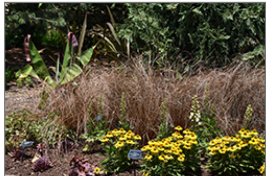
Firefox Leatherleaf Sedge