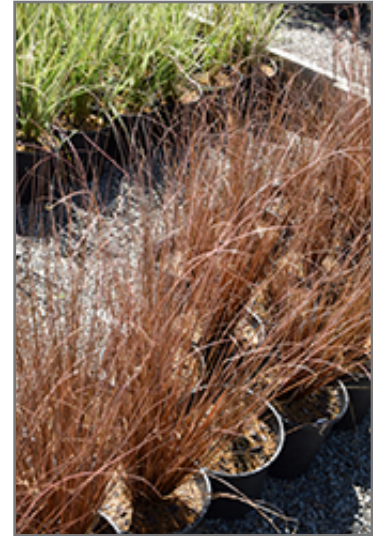
Firefox Leatherleaf Sedge

Firefox Leatherleaf Sedge is a fine choice for the garden, but it is also a good selection for planting in outdoor pots and containers. It can be used either as 'filler' or as a 'thriller' in the 'spiller-thriller-filler' container combination, depending on the height and form of the other plants used in the container planting. It is even sizeable enough that it can be grown alone in a suitable container. Note that when growing plants in outdoor containers and baskets, they may require more frequent waterings than they would in the yard or garden.