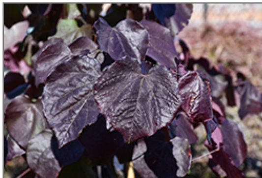
Black Pearl Redbud foliage