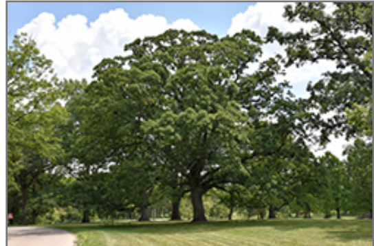
White Oak