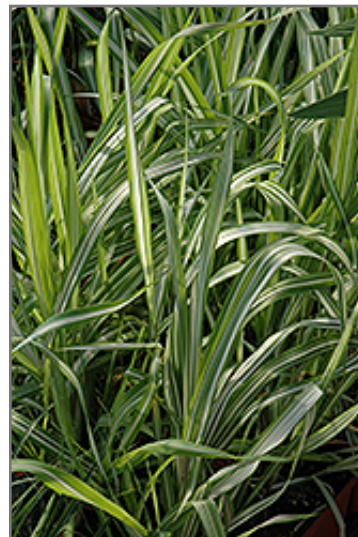
Strawberries And Cream Ribbon Grass foliage

Strawberries And Cream Ribbon Grass will grow to be about 3 feet tall at maturity, with a spread of 3 feet. It grows at a fast rate, and under ideal conditions can be expected to live for approximately 20 years. As an herbaceous perennial, this plant will usually die back to the crown each winter, and will regrow from the base each spring. Be careful not to disturb the crown in late winter when it may not be readily seen!