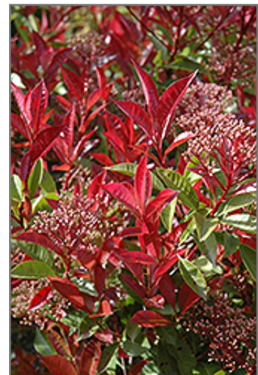
Fraser Photinia flowers