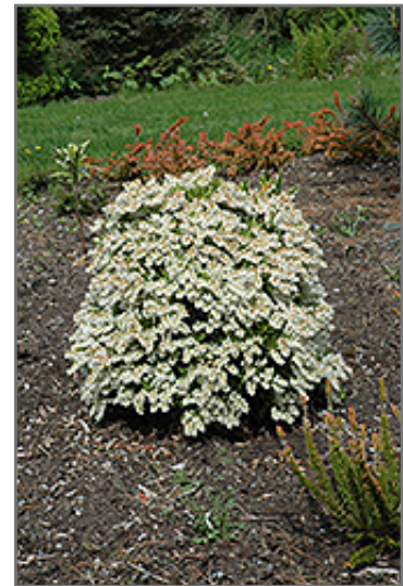
Prelude Japanese Pieris in bloom