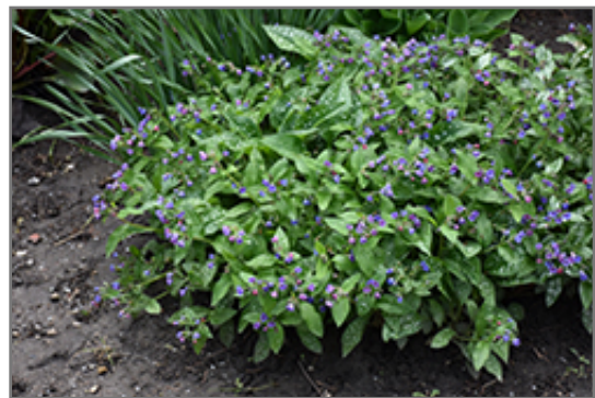
Dark Vader Lungwort in bloom