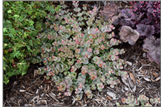
October Daphne

October Daphne is recommended for the following landscape applications;